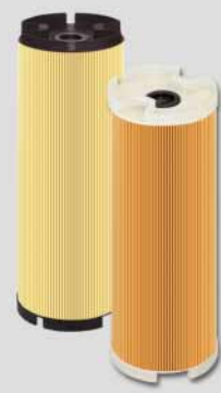
H 15 190/16 Premium

Quality level recommended by Agie and Charmilles