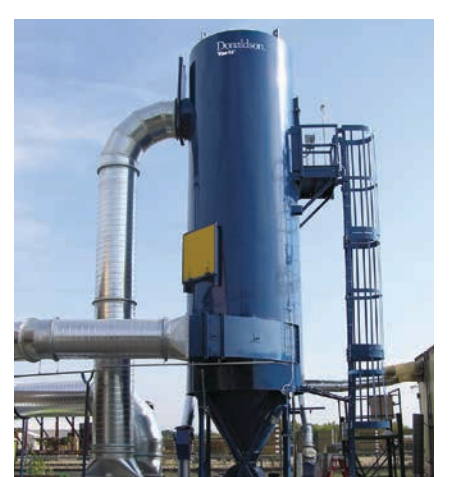
RF Dust Collector