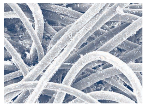
Needled Polyester Bag Clean Air Side (300X)

Dura-Life bag filters are engineered with a unique hydro-entanglement process that uses water to blend the bag fibers, creating a more uniform material with smaller pore size that provides better surface loading of dust and prevents penetration deep into the media. In contrast, conventional polyester bags are manufactured with a needling process that creates larger pores where dust can embed into the fabric, inhibiting cleaning and reducing bag life. With better surface loading, Dura-Life bags provide improved pulse cleaning and a lower pressure drop, which results in extended bag life, less maintenance time and cost, energy savings and greater filtration efficiency.