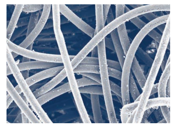
Dura-Life Bag Clean Air Side (300X)

These photos were taken with a scanning electron microscope of bag media used in a collector that was filtering fly ash. The bags were removed after 2,700 hours of use. Air-to-media ratio was 4.5 to 1, Pressure drop after 2700 hours of operation was 6 in. (152.4 mm) on polyester bags and 2 in. (50.8 mm) on Dura-Life.