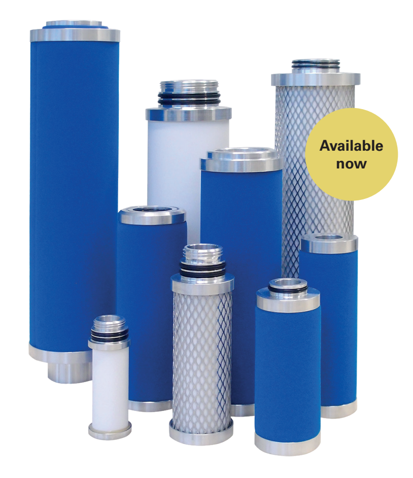
Replacement filters are on stock and ready to ship!